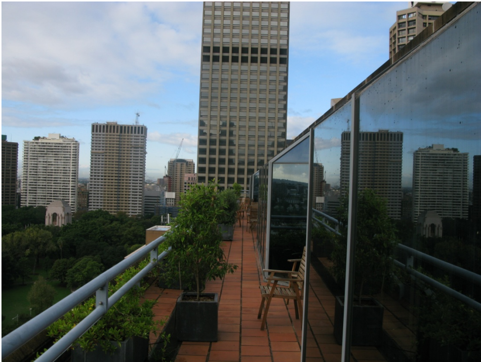
Balcony on East façade demonstrating that no buildings encroach upon view within 8m