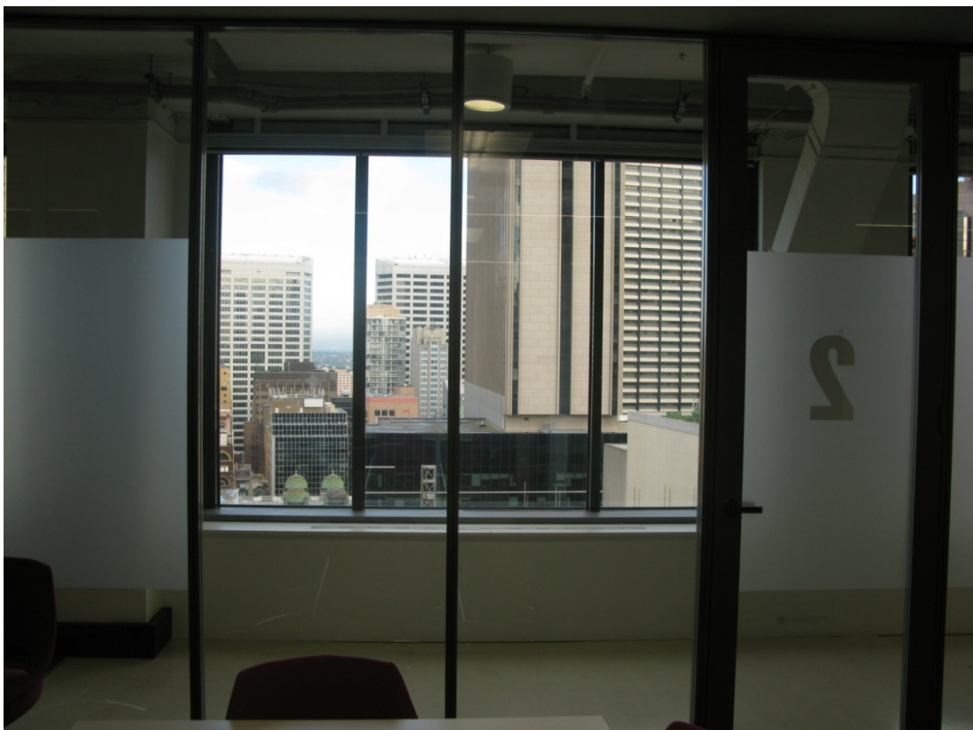
Meeting Room 2 showing full height glazing – external view