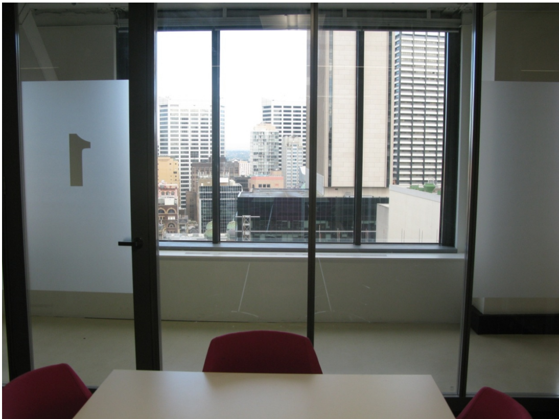
Meeting Room 1 showing full height glazing – external view

Greenhouse, Level 15, 179 Elizabeth Street, Sydney NSW 2000