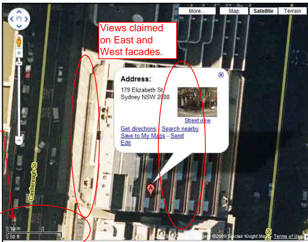
Google Map shows proximity to other buildings on East and West facades where views are claimed.